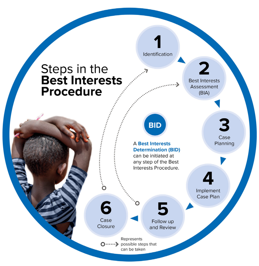
Figure D: Child Best Interests Procedure<sup>54</sup>