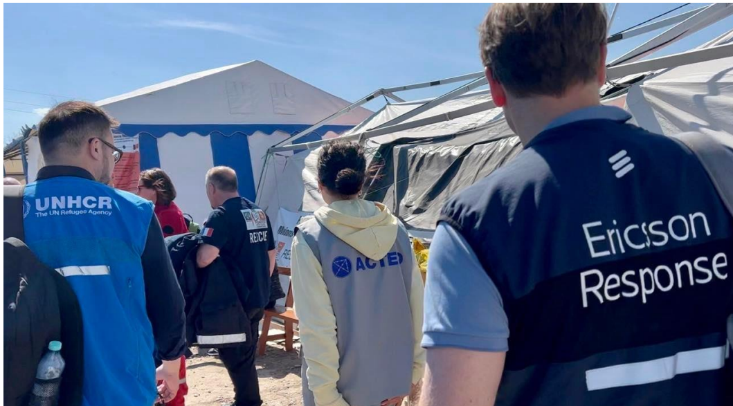
RETS partners conduct a joint mission to the Palanca Humanitarian Hub to visit the Blue Dot and other sites where connectivity is being provided