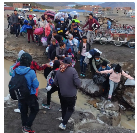
Refugees and migrants crossing in Colchane by irregular points. - Chilean border

against irregular migration and crime in the northern region have taken place, with a fired up a discourse against the UN and its work. This has been paired with the omicron variant rise of COVID-19 cases in the northern region over the first months of the year.