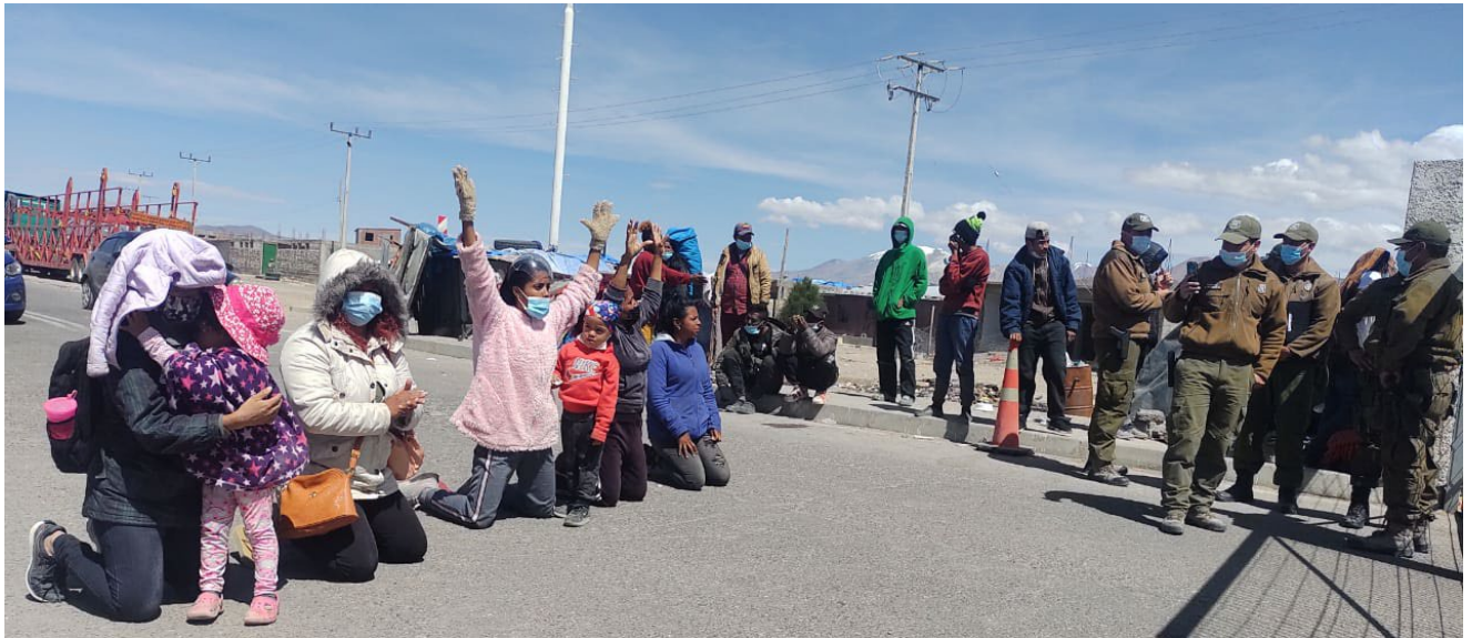
Refugees & migrants from Venezuela imploring for their rights to be respected at the Chilean border © UNHCR/ Chilean media, 2022