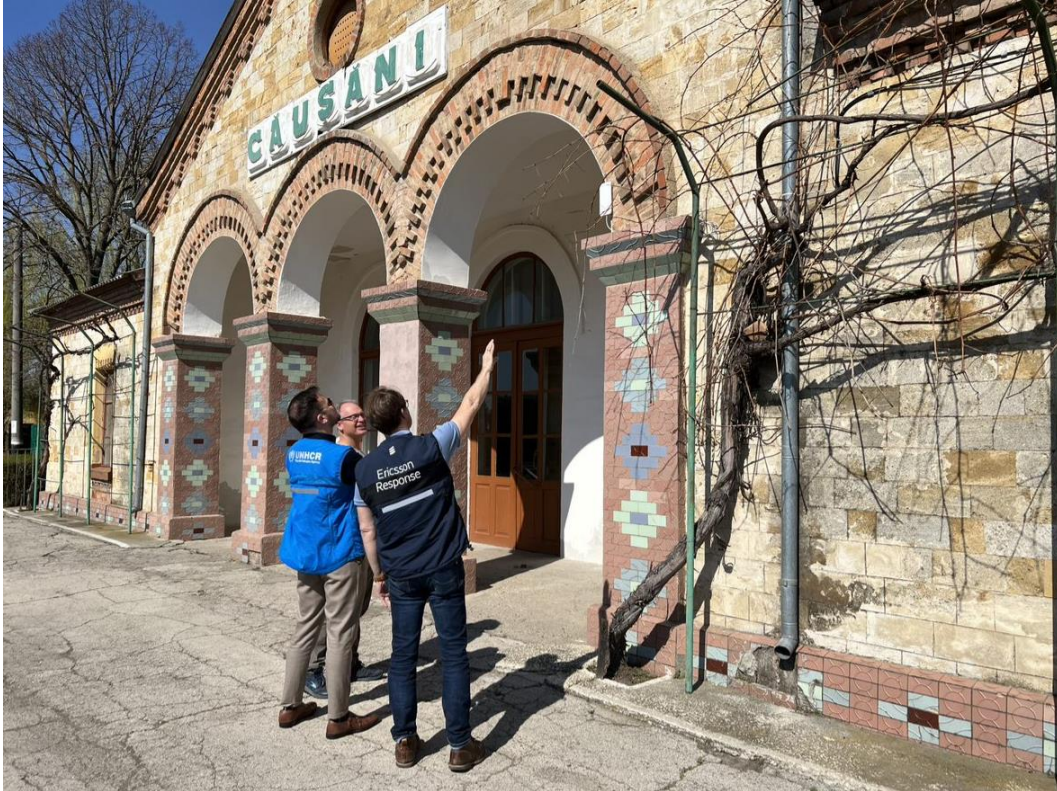
Ericsson Response and UNHCR conduct visit to Căușeni Train Station, which has served as one of the main transportation hubs since the start of the Ukraine crisis. Connectivity is provided here to humanitarians and refugees thanks to the support of Cisco Crisis Response and Ericsson Response.