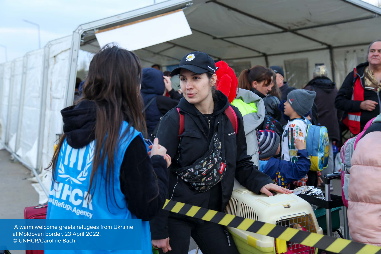
A warm welcome greets refugees from Ukraine at Moldovan border, 23 April 2022.