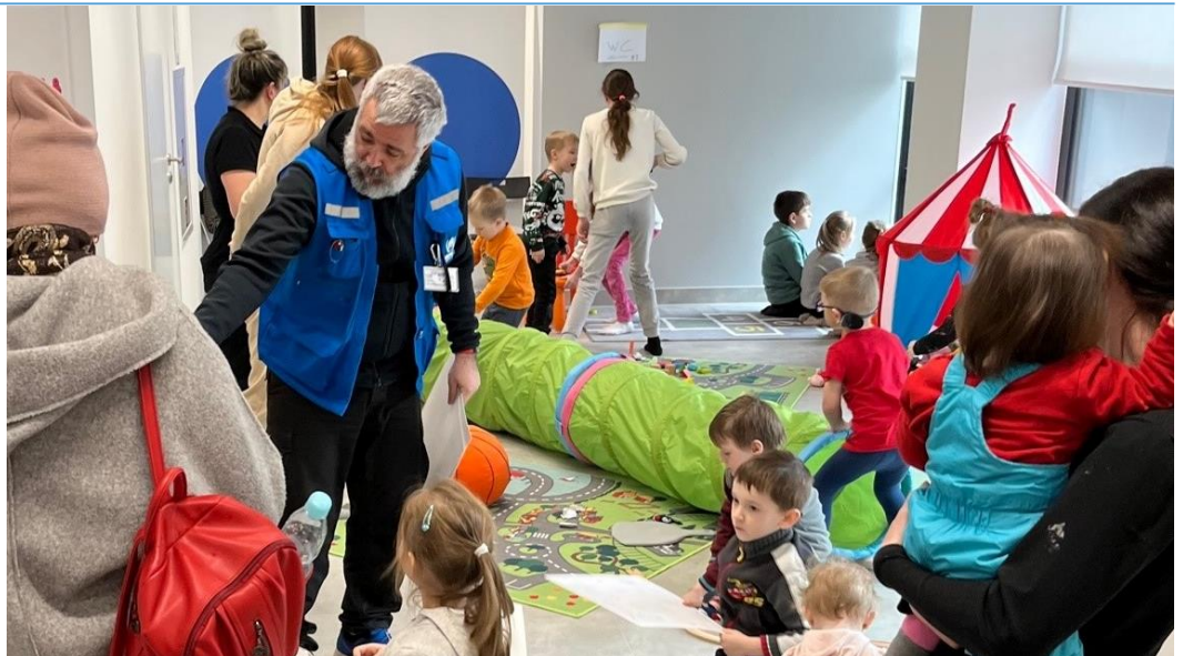
Children and families keep warm on a rainy day at the Blue Dot hub in Warsaw 1 Cash Enrolment Centre. 2 April 2022

Over 3,000 refugees received in person support and counselling at Blue Dots in Poland so far