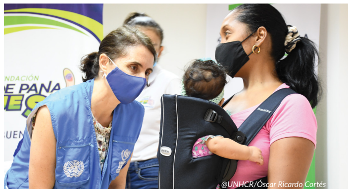
UNHCR Barranquilla providing baby carriers to Venezuelan mothers with specific protection needs (2021).