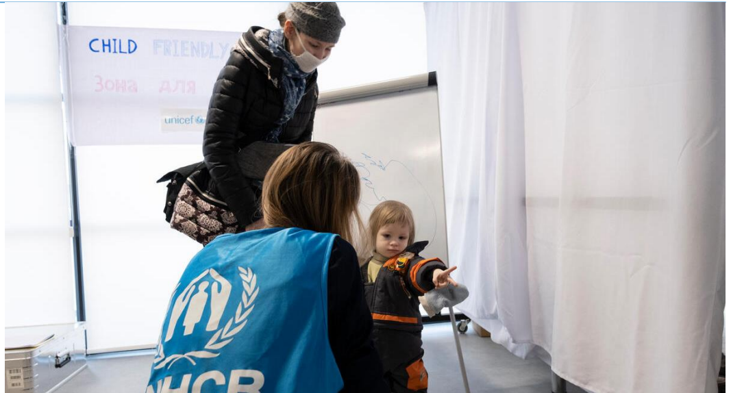
Blue Dots with safe spaces for children like Andre, mothers, and other people in need of support are established in all UNHCR's cash enrolment centres. © UNHCR/M. Moskwa, 21 March 2022

Over 5,600 refugees received in person support and counselling at Blue Dots in Poland so far