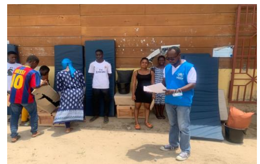
Some refugee students due for the Senior High School in Ampain receiving essential items from UNHCR for the boarding house.