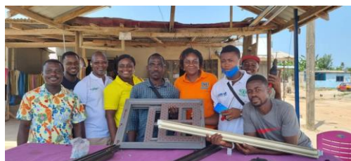
Some refugee youth trained in glass glazing with officials from the NVTI and UNHCR.