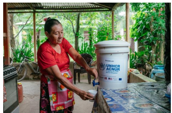
A woman of a solidary family provides drinking water and information to people on the move in Izabal on the border with Honduras.