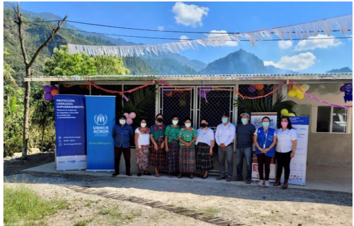
Inauguration of the new community centre in the village Nuevo Queja, San Cristobal Verapaz, Alta Verapaz.