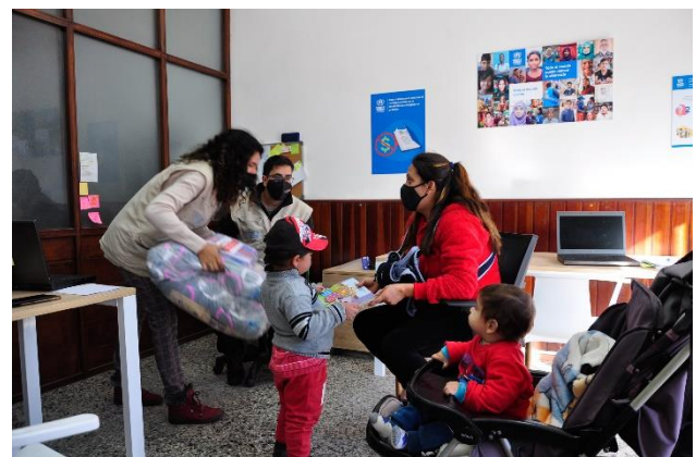
UNCHR and partner agency Idas y Vueltas deliver coats to refugee and migrant families entering Uruguayan territory in the PAO of Chuy.