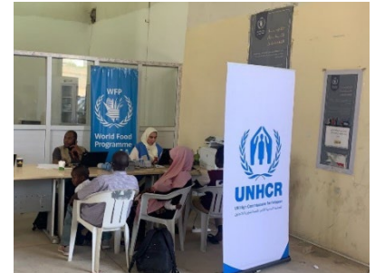
Asylum seekers being processed by UNHCR and partner staff following their release from detention.

On 16 May, UNHCR helped with the transfer of 80 asylum seekers, including 25 women and 47 children, from Ain Zara detention centre. Upon their transfer, UNHCR and partners provided medical, food and cash assistance while specific services were provided to those identified with other urgent needs, including shelter arrangements. The individuals will be assisted with core relief items in the coming days. UNHCR continues to work closely with the Libyan authorities to secure the orderly transfer of other refugees and asylum seekers being held in detention. As of 15 May, it is estimated that there are 2,702 persons held in detention centres across Libya, of whom 567 individuals are persons of concern to UNHCR.