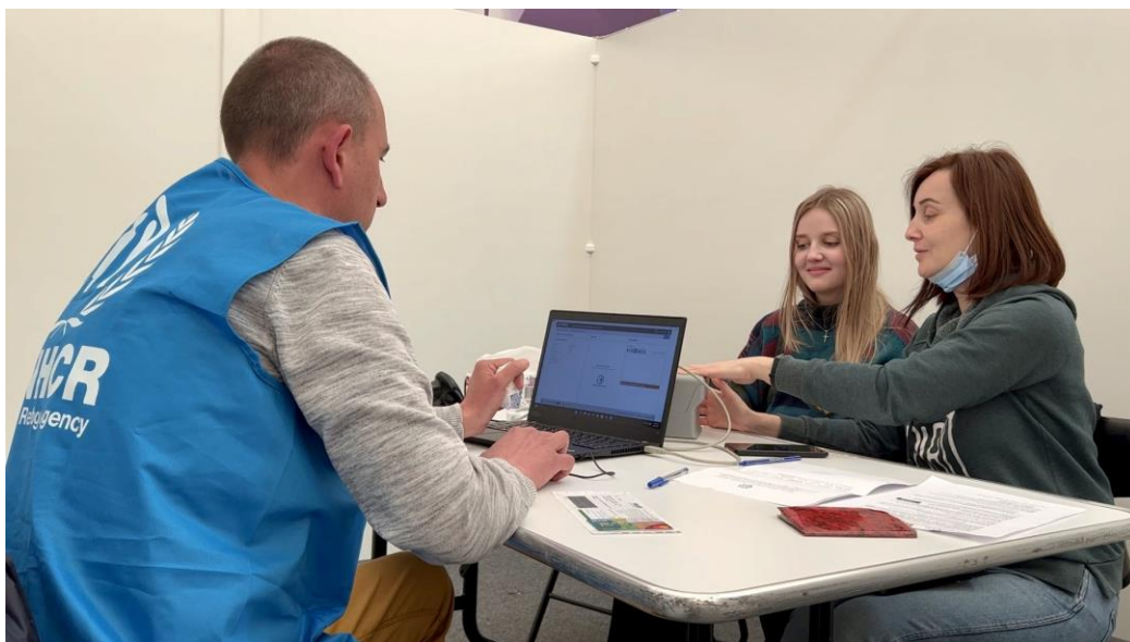
Refugees from Ukraine register to receive cash assistance from UNHCR. The registration process relies on internet connectivity set up by UNHCR and partners.