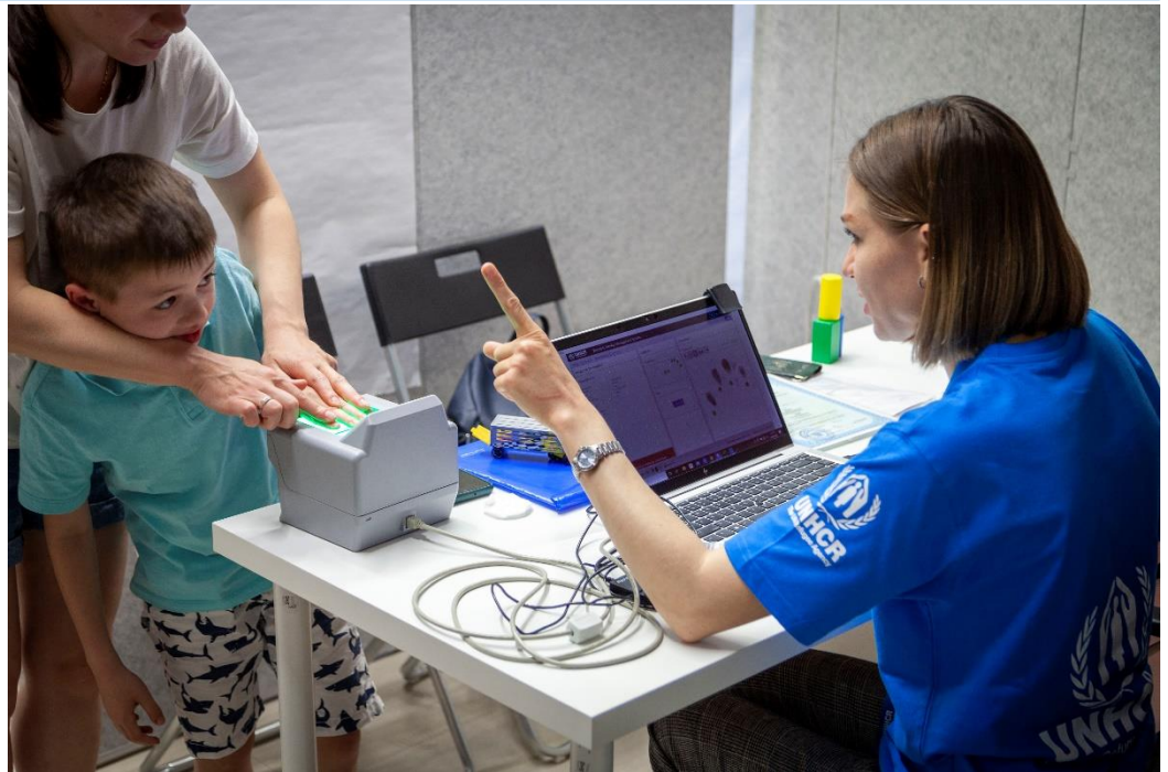
Refugees from Ukraine – mostly women and children – are enrolled to receive cash assistance from UNHCR at the cash enrollment centre in Wrocław, Poland.