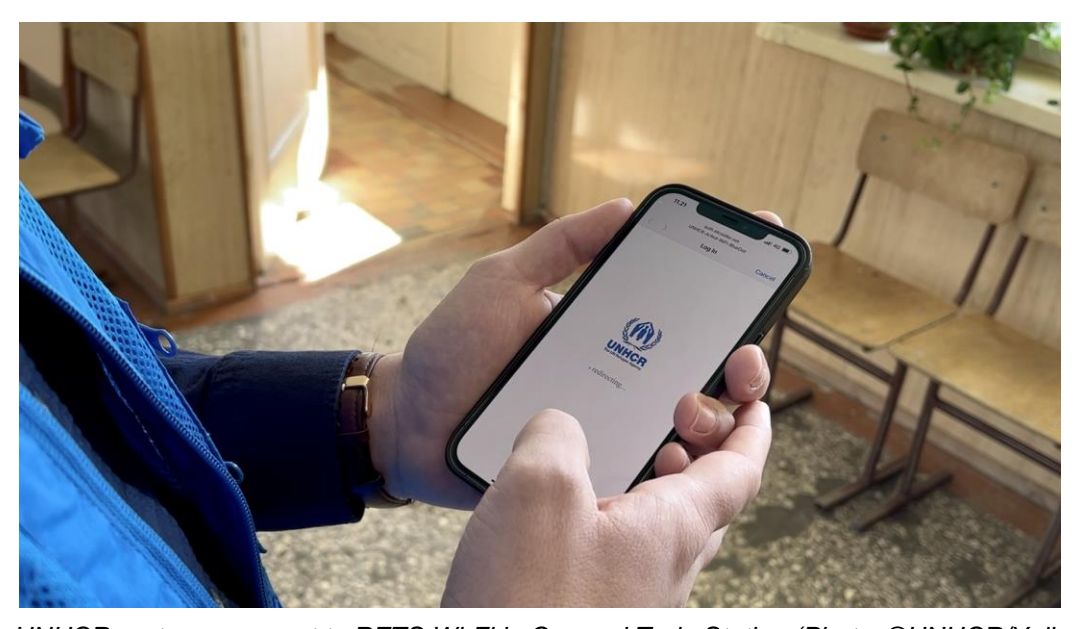
UNHCR partners connect to RETS Wi-Fi in Causeni Train Station