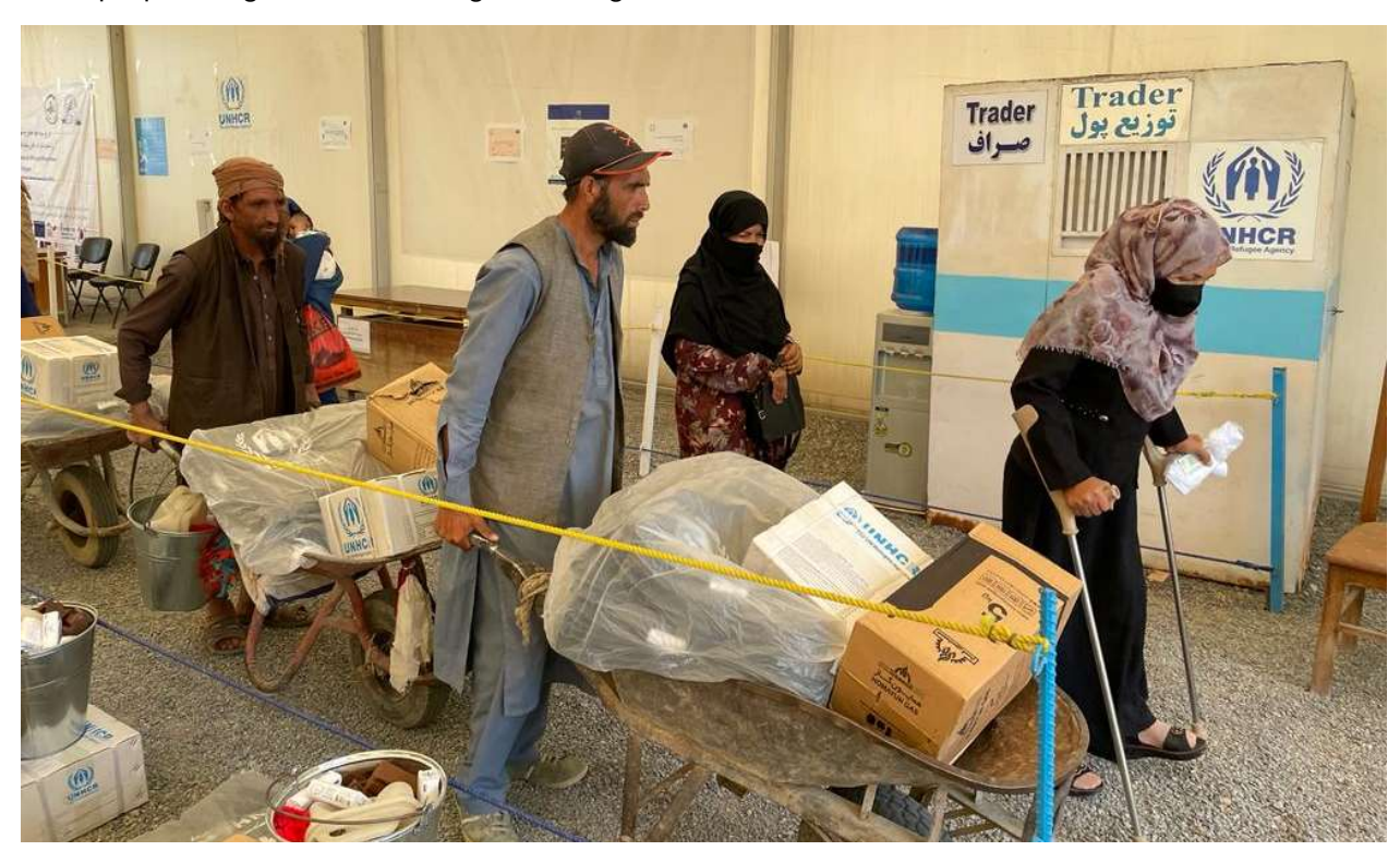
NFI Kits distribution to vulnerable households including female beneficiaries in Kabul.

Afghanistan continues to experience an overwhelming humanitarian crisis of unprecedent proportions and scale. The severity of the situation is further exacerbated by the increasing potential for insecurity, continued political and economic uncertainties, and the COVID-19 pandemic. Over 700,000 conflict-related displacements have been jointly verified since the beginning of 2021 – 80 per cent of them women and children. Overall, 3.5 million people are estimated to be displaced internally countrywide due to conflict while more than 2 million are refugees in neighboring countries. According to the 2022 Humanitarian Response Plan (HRP), some 24.4 million of Afghanistan's estimated 42 million population will need humanitarian and protection assistance this year. According to the latest Integrated Food Security Phase Classification (IPC) analysis conducted in January and February this year by the World Food Programme (WFP), Food & Agriculture Organization (FAO), and other NGOs, about 19.7 million people in Afghanistan are facing acute hunger.