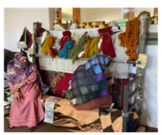
Women Garment Centre funded by UNHCR in Kabul.

***IDP returnees are those who went back to their communities in 2021 (Source: UNHCR Rapid Assessment)