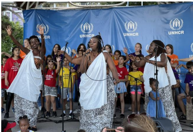
Playful African melodies together with energetic children’s improvisations created a unique fusion of sounds and rhythms

On the eve of WRD, an open-air concert on a frequented promenade along the Danube, promoted cultural exchange and social inclusion. It gathered children from socially vulnerable groups, refugee and local children as well as the dance group of asylum-seekers from Burundi accommodated in the asylum centre Krnjača.