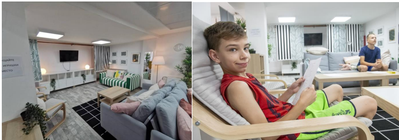
Common space in the Centre Vranje

In all, 774 persons were registered for temporary protection in the period 25 February – 30 June. In the same period, 720 persons were issued Decisions on Temporary Protection , which the authorities started issuing formally on 5 May.