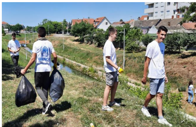
Young refugees and their local peers stood side by side in cleaning the bank of the river Sava

In line with its commitment to contributing to the reduction of the global environmental footprint, UNHCR organized the cleaning of the banks of the river Sava in Obrenovac . The participants included 27 refugees and migrants from the asylum centre, the students of the Obrenovac Technical School, and their biology teacher. The event was also supported by SCRM, and partner Crisis Response and Policy Centre (CRPC). The passers-by expressed their support and gratitude and asked to be included in similar activities the next time.