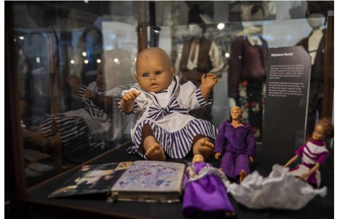
Refugees from former Yugoslavia, the Middle East, Africa, and Ukraine lent to UNHCR the object they had brought with them when they left their homes behind