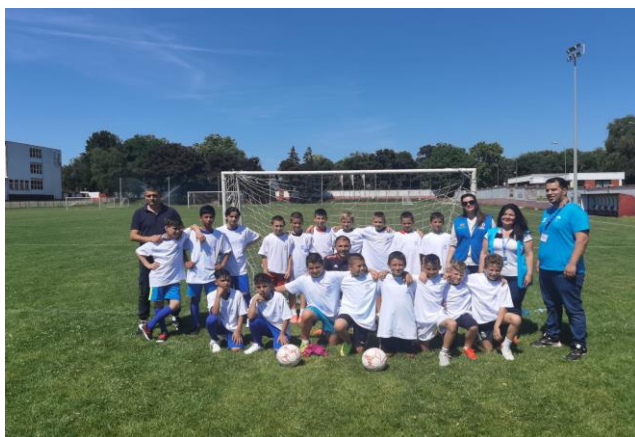
The tournament gathered 20 children

On the eve of WRD, an open-air concert on a frequented promenade along the Danube, promoted cultural exchange and social inclusion. It gathered children from socially vulnerable groups, refugee and local children as well as the dance group of asylum-seekers from Burundi accommodated in the asylum centre Krnjača.