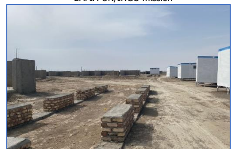
On-going construction at Niatak Site