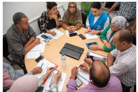
Workshop with partners on Education for refugee children-Medenine.

On 21 June, UNHCR and partners organized a workshop with counterparts from the Ministry of Education, Ministry of Women and Child Development, Ministry of Social Affairs, and local psychologists in Medenine Governorate. The aim of this workshop was to strengthen collaboration for protecting refugee and asylum-seeking children in schools and learning environments in Tunisia.