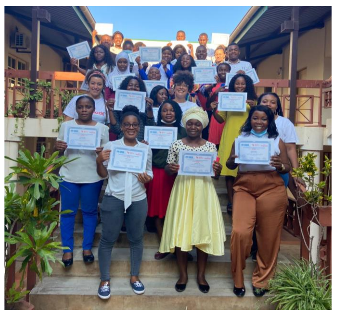
GBV Caseworkers from UNHCR partners, government and NGO services graduate from the UNHCR GBV case management training, Pemba

10 mobile safe spaces providing integrated GBV, Mental Health and Psychosocial Support (MHPSS) services