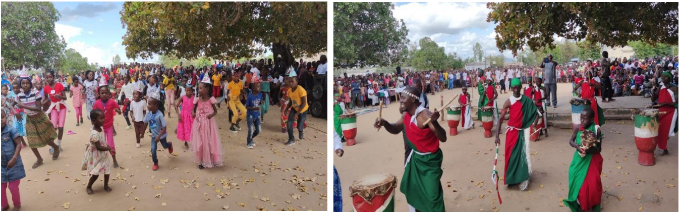
WRD Celebrations in Maratane Settlement, Nampula Province.