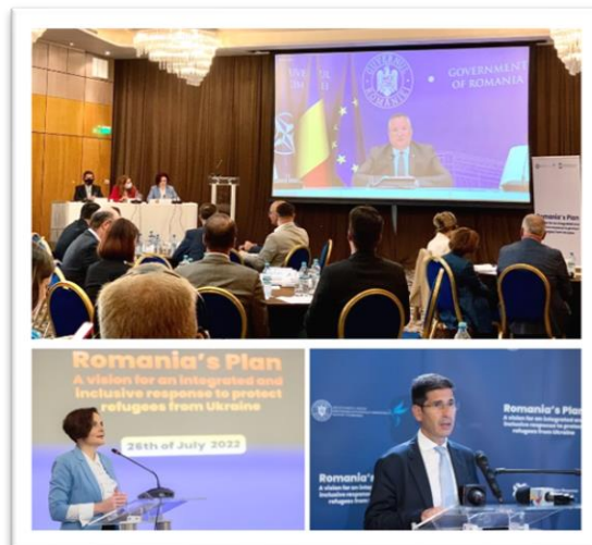
Release of the National Plan event held on 26 July 2022 in Bucharest, Romania

During the opening remarks through video call, the Prime Minister of Romania H.E. Nicolae Ciucă, affirmed Romania's solidarity with the refugees from Ukraine. Together, the NP and the RRP for Romania they represent -in the words of Prime Minister Ciucă- Romania's response to the humanitarian refugee crisis in the medium and long term. The donor community, represented by Embassies of France, United Kingdom and United States of America (among the Embassies participating), congratulated Romania for their plan and highlighted this as a good practice in the region.