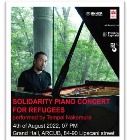
Poster of the “solidarity piano concert for refugees” in Bucharest, Romania – 4 August 2022

UNHCR is grateful to the donors of unearmarked and softly earmarked contributions to the Ukraine situation. UNHCR Romania is also grateful to donors contributing to its 2022 programmes.