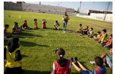
Internally displaced and refugee children in Abusliem Stadium.

Phase two of UNHCR's Sports for Peace Initiative began on 3 August. The pilot project, with sport at its heart, is aimed at developing life skills and improving social cohesion among IDPs, IDP returnees, asylum seekers, refugees, and the host community in Abusliem municipality in Tripoli. 60 children, including 45 IDPs and 15 refugees, participated in the first session of the sports activities organized by partner Libyan Scouts in Abusliem stadium, which has been rehabilitated as part of the project. The children will attend four sessions with four different modules designed by partner Fútbol Más. Each session aims to raise awareness of a specific social topic and connected with one or more of the UN Sustainable Development Goals (SDGs).