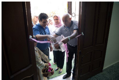
The ceremony at Rabaa Aladawiyah School.

UNHCR, through partner INTERSOS, rehabilitated the Rabaa Aladawiyah School in Tripoli. On 7 August, a ceremony took place marking the completion of the rehabilitation, attended by the officials from the municipal council as well as the education office of Tripoli municipality and some pupils. The work included installing a new water system and bathrooms, lighting, a CCTV, doors, and windows, as well as the repainting of the building. The school provides classes for more than 520 students, including some non-Libyans.