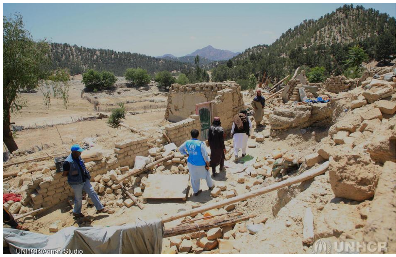
A UNHCR assessment team walks through the rubble in a village in Spera District, Khost Province where some 100 families who were made homeless by the earthquake were provided with UNHCR tents, household supplies, and dignity kits.

On 22 June 2022 a 5.9 magnitude earthquake struck vulnerable districts in Paktika and Khost provinces, south-eastern Afghanistan. Over 1,000 people are estimated to have been killed, including 250 children, while an additional 3,000 people were injured, among them 600 children. At least 1,500 homes are reported to have been damaged in Giyan district of Paktika province alone. Interagency teams including UNHCR were quickly on the ground to assess the situation. Findings from rapid assessments reaffirm the extensive damage to houses, absence of (and lack of access to) basic services such as water, education, health, electricity, access roads in remote locations, and lack of viable livelihood opportunities. It is estimated that at least 70% of the houses in the most impacted areas are damaged or destroyed, leaving many without shelter and sleeping in the open, prone to harsh weather, health and protection issues, and other hazards. A US$110.3 million multisectoral earthquake appeal released by OCHA (including the needs of UNHCR), targets 362,000 earthquake-affected people across south-eastern Afghanistan with essential aid like emergency shelter support, food assistance, health support and protection.