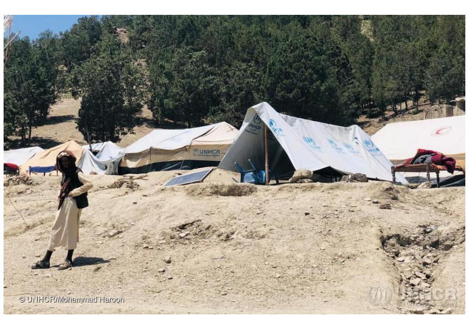
Earthquake survivors take shelter in UNHCR tents and under plastic tarpaulins in a village in Spera District, Khost Province. UNHCR teams were on hand to provide families with urgently needed shelter materials, household items, and dignity kits for women and girls.

Following interagency assessments, UNHCR's immediate response involved the distribution of 1,600 shelter and non-food item (NFI) kits (including tents) and 1,500 dignity kits for vulnerable women and girls. The UNHCR response has already benefited a 12,700 total of affected individuals in Khost and Pakitka provinces. While UNHCR and partners continued to implement their emergency response to the first earthquake. several aftershocks have been felt, and on 18 July a new 5.1 magnitude earthquake hit Spera district (only 3km from the epicentre of the June earthquake), also impacting Barmal, Giyan, and Zuruk districts, and causing further destruction. As of 4 August, an additional 1,992 family tents have been dispatched to support newly assessed families in Spera district.