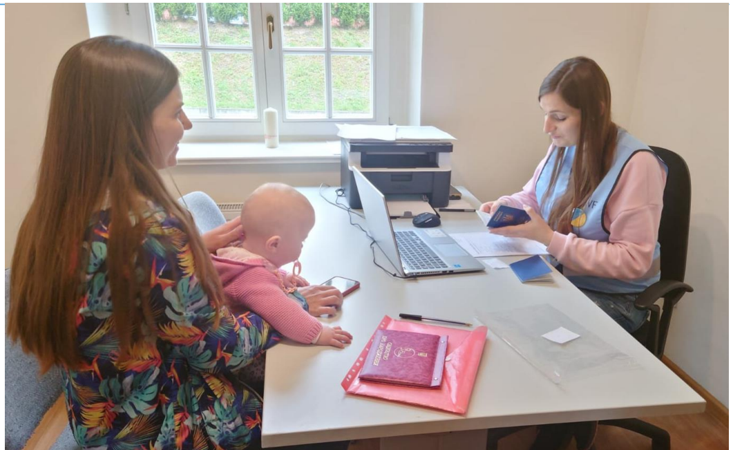
Refugees from Ukraine – mostly women and children – are enrolled to receive cash assistance at the newly established cash enrollment centre in Bytom, Poland. © UNHCR/ Wisdom Enalebor, 08 June 2022

FILIPPO GRANDI United Nations High Commissioner for Refugees