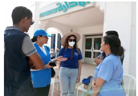
UNHCR and IOM staff alongside CTR members discussing the health situations of refugees with medical

During July, a home visits program reached out to a group of refugees with disabilities living in urban areas in southern Tunisia. With UNHCR’s support, the Tunisian Council for Refugees (CTR) will deploy health professionals and case workers to visit refugees in Zarzis and Medenine to provide health awareness sessions, while informing refugees on various issues such as personal hygiene, maternal care, and the importance of vaccination.