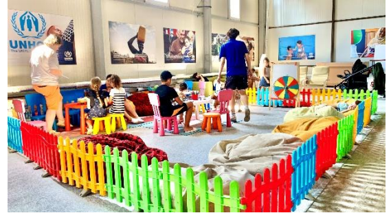
Child-friendly space at RomExpo one-stop service Centre for refugees, Bucharest, Romania.