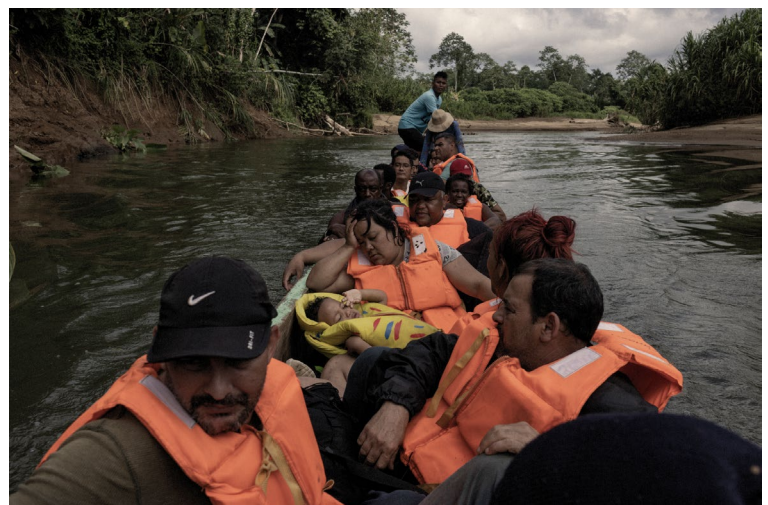
Panama. Refugees and migrants brave hazardous jungles of Darien Gap on their way north