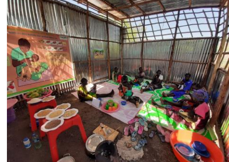
Complementary feeding cooking demonstration in Pinyudo camp