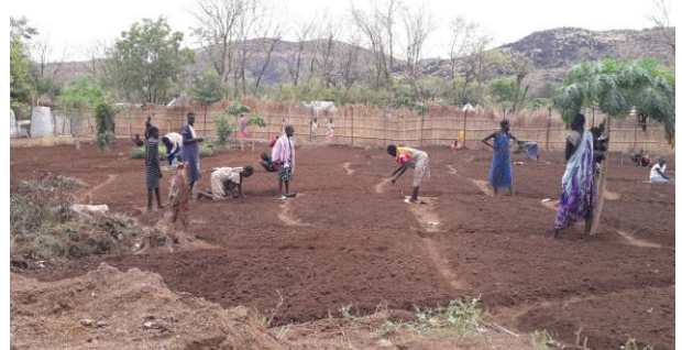
Programme beneficiaries preparing land for gardening in Tierkidi camp