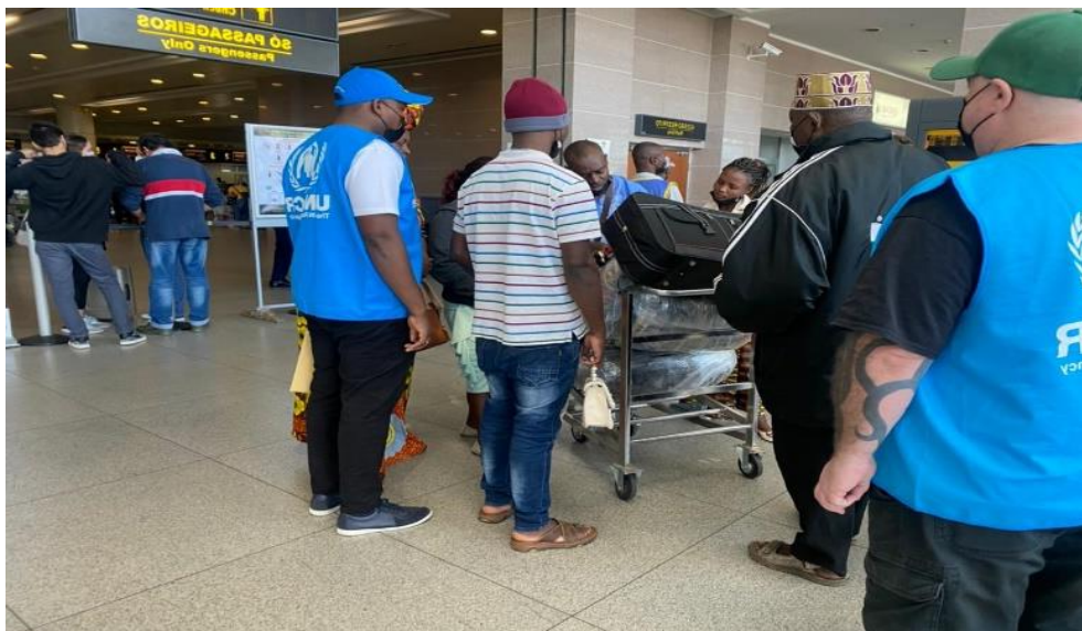
UNHCR Assisting VolRep at Maputo Airport