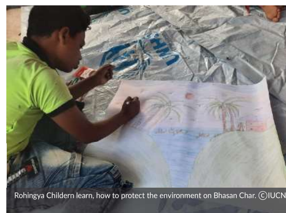
Rohingya Children learn, how to protect the environment on Bhasan Char.

UNHCR completed the data collection for the Nutrition Survey on the island in coordination with WFP and UNICEF. This will allow to best address nutrition needs on Bhasan Char moving forward. The National Nutrition Services (NNS) line Director inaugurated the training of partners BRAC, GK and Friendship who undertook the survey on Bhasan Char.