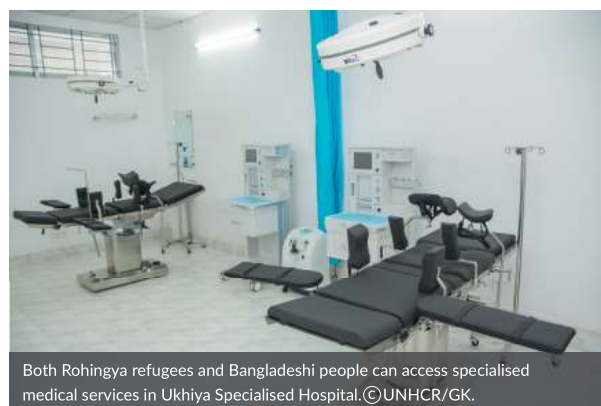
Both Rohingya refugees and Bangladeshi people can access specialised medical services in Ukhiya Specialised Hospital.

UNHCR completed the data collection for the Nutrition Survey on the island in coordination with WFP and UNICEF. This will allow to best address nutrition needs on Bhasan Char moving forward. The National Nutrition Services (NNS) line Director inaugurated the training of partners BRAC, GK and Friendship who undertook the survey on Bhasan Char.