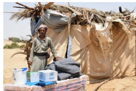
Male Displaced effected from floods received emergency shelter kits in AlJawaf. ©UNHCR.YARD. August2022

UNHCR and partners continue to address the needs of displaced families affected by heavy rains and sandstorms. During the reporting period, UNHCR's partners assessed more than 9,222 displaced families in several IDP sites 3,232 HH in Sana'a, 695 HH in Ibb, 3,052 HH in AlHoudaydah, 945 HH in Saada and 1,298 HH in Marib.