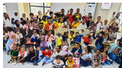
EILC Graduation ceremony for EILC children in Aden. ©UNHCR/Ahmed_Mayadeen. August2022

On 17 August, a graduation ceremony was organized for 7 children with disabilities ( 4 Somalis boys and 3 Yemeni girls ) who studied at the Early Intervention and Learning Centre (EILC) and successfully passed the placement test set by the schools and are ready to enroll in public schools.