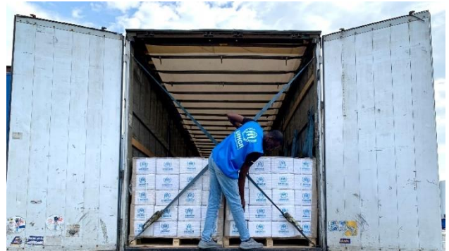
Shipping of humanitarian aid to Ukraine.

Inclusion: UNHCR, along with researchers from university centres in Bucharest, Cluj and Sibiu, is participating to the Arab Culture Festival in Sibiu during 2-4 September. At the event, and as regional good practice to foster refugee inclusion, UNHCR highlighted the Government of Romania's adoption of the National Plan of Measures for Protection and Inclusion of refugees from Ukraine . This will enable refugees to contribute to all aspects of the social and economic life of Romania - leading to sustained social harmony.