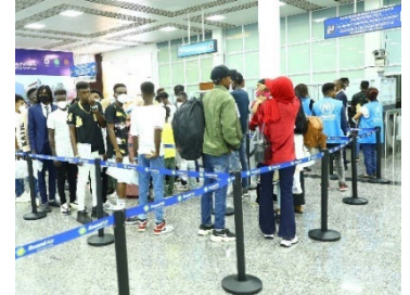
UNHCR staff assisting asylum seekers upon their arrival in Rwanda.

On 31 August, UNHCR evacuated 101 asylum seekers, including 22 women and 38 children, from Libya to safety in Rwanda. The group will receive shelter and assistance at the Emergency Transit Mechanism in Gashora. On 5 September, 33 refugees, including ten women and 15 children, were resettled from Libya to Europe. Since 2017, 8,919 asylum seekers and refugees have departed from Libya on direct resettlement and evacuation flights, as well as through complementary pathways including humanitarian visas and family reunification. UNHCR is grateful to the relevant Libyan authorities for their support in facilitating necessary formalities for these humanitarian evacuation flights and continues to urge countries to provide more legal pathways to help some of the most vulnerable people reach safety out of Libya.