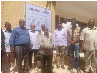
The ceremony marking the completion of rehabilitation work at the Arab Al-Sahraa School.

On 30 August, a ceremony was held, marking the completion of rehabilitation work at the Arab Al-Sahraa School in Bent Baya municipality south of Libya, hosting Libyan and non-Libyan students. The work, overseen by partner ACTED, included rehabilitating bathrooms, doors, windows, installing a new electrical system, and repainting of the premises. Quick Impact Projects like this aim to improve peoples' access to local services and promote peaceful coexistence in areas hosting displaced Libyans, returnees, and asylum seekers.