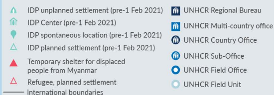
Estimated internal displacement within Myanmar Pre+Post 1 February 2021 (rounded to the nearest hundred)

The boundaries and names shown and the designations used on this map do not imply official endorsement or acceptance by the United Nations