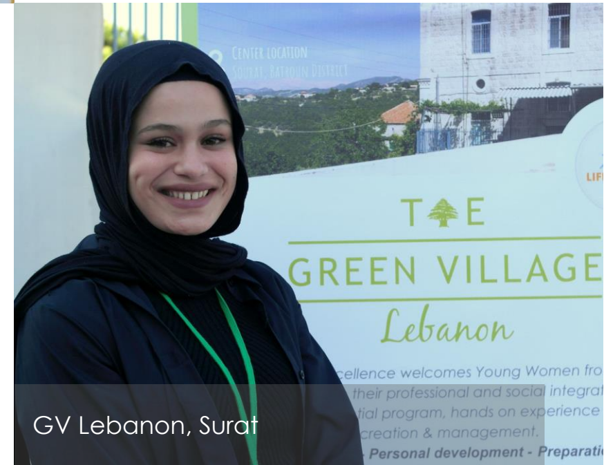
GV Lebanon, Surat

LP4Y believes that all Young people have potential , and that empowering them with an entrepreneurial mindset will make them actors of their lives and allow them to contribute to an inclusive, sustainable and prosperous world .