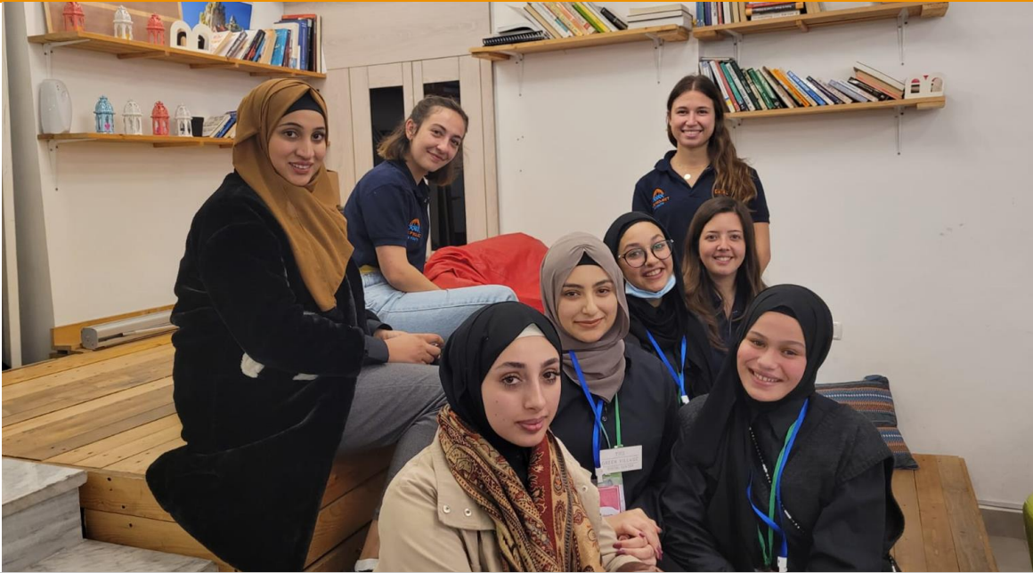
Tripoli Entrepreneurs Club, TDC and GV Lebanon- Internship