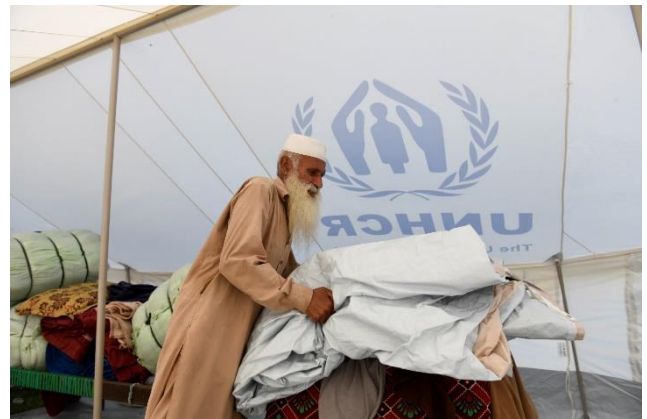
UNHCR is scaling up the distribution of much needed shelter materials and household items to flood-affected communities in Pakistan

In late-August, the Government of Pakistan and the United Nations launched a $160 million emergency plan to help Pakistan respond to the devastation. The plan focuses on the needs of 5.2 million people and scaling up assistance in critical sectors. As climate shocks become more frequent in Pakistan, ramping up prevention and preparedness measures to avert, minimize and respond to the impacts of climate change and disaster-related displacement remains critical.