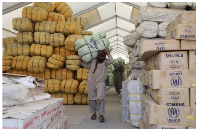
To date, 55 per cent of life-saving supplies have been delivered in Pakistan for distribution