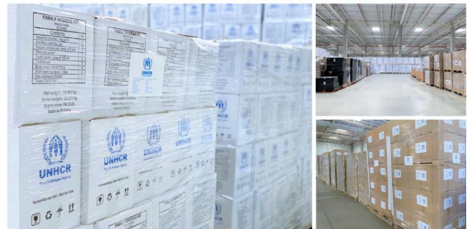
Pre-positioned aid materials in UNHCR warehouse near Bucharest, Romania.

UNHCR has pre-positioned over forty types of core relief materials to continue supporting the national response, including with foreseeable additional needs related to the winter season. UNHCR works closely with the Department of Emergency Situations (DSU) and UN Agencies to ensure a coordinated and harmonized response.