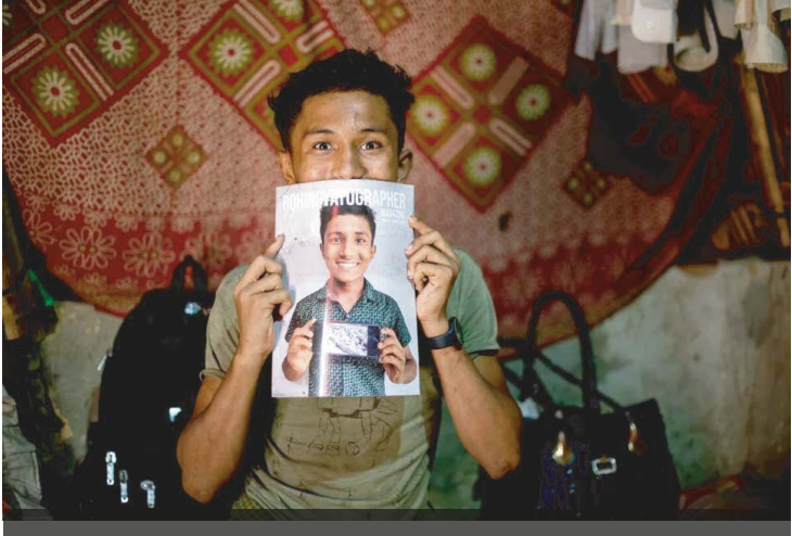
A must see video of an inspiring Rohingya teen who has found a way to communicate through photography.