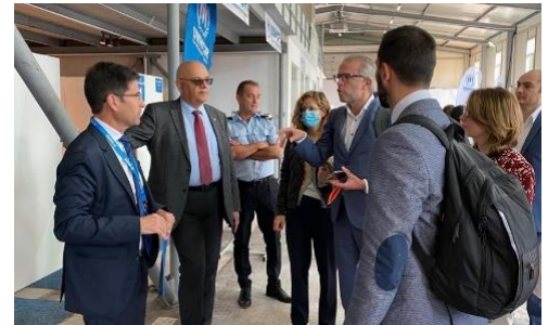
The European Parliament delegation visiting UNHCR's one stop service centre at RomExpo.

On 21 September, UNHCR together with the Department for Emergency Situation (DSU), facilitated a visit to UNHCR's one-stop service centre at RomExpo in Bucharest by a delegation from the Committee on Civil Liberties, Justice and Home Affairs (LIBE) of the European Parliament led by Mr. López Aguilar and briefed the participants on various services available for refugees from governmental institutions, UN Agencies and NGOs. On 22 September, the delegation, also visited the Isaccea border crossing point with Ukraine (southern Romania) and observed UNHCR's response. Recently, UNHCR also facilitated visits to RomExpo by delegations from Japan and Chile.