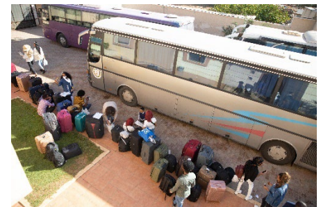
Asylum seekers on their way to the airport.

On 27 September, to further strengthen UNHCR's communication with the communities in Libya, UNHCR launched its Help Page in Amharic and Tigrinya languages. The page provides information, phone numbers, emails and useful videos for asylum seekers and refugees in Libya and is now available in five languages.