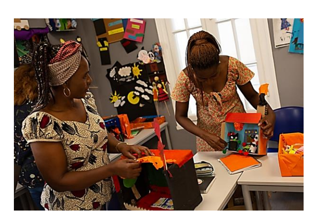
Refugee women learn how to make handicraft for children during a "Child care Assistants" class.

Lack of child care has been identified as one of the impediments for employment among women, whether they are refugees or nationals. The "Child care Assistants" project is a pilot