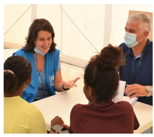
During a Job Fair on Lesvos, refugees had the opportunity to meet with local employers.

On the mainland, two job fairs were held in Thessaloniki and one in Athens, attracting 784 participants and 68 employers in total. The interviews conducted during these fairs reached 3,000, resulting in 335 job offers.