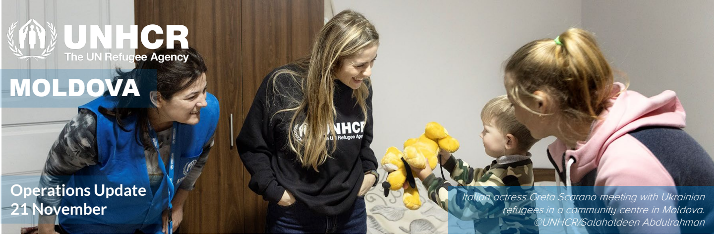
Italian actress Greta Scarano meeting with Ukrainian refugees in a community centre in Moldova.