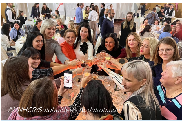
On 19 November, the Embassy of Italy in Moldova launched the seventh edition of the Week of Italian Cuisine in the World "Italian food for peace". UNHCR supported the event which was attended by some 200 refugees and Moldovans.

697,966 arrivals from Ukraine since 24 February