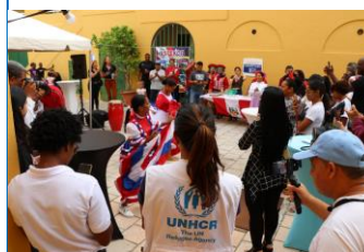
World Refugee Day in Curaçao