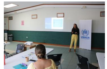
Capacity Building for CBO's Aruba

On World Refugee Day, in Curaçao UNHCR and partners organized a fair for refugees and migrants where they could learn about the humanitarian organizations and taste the cuisine of the different nationalities living on the island.