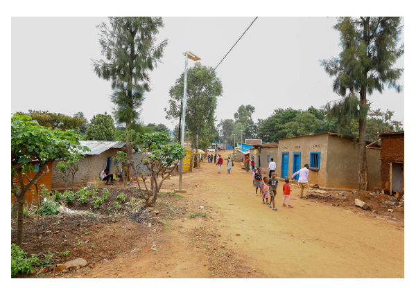
The main market street in Nyabiheke refugee camp

UNHCR FIELD OFFICE IN KABARORE COVERS NYABIHEKE REFUGEE CAMP