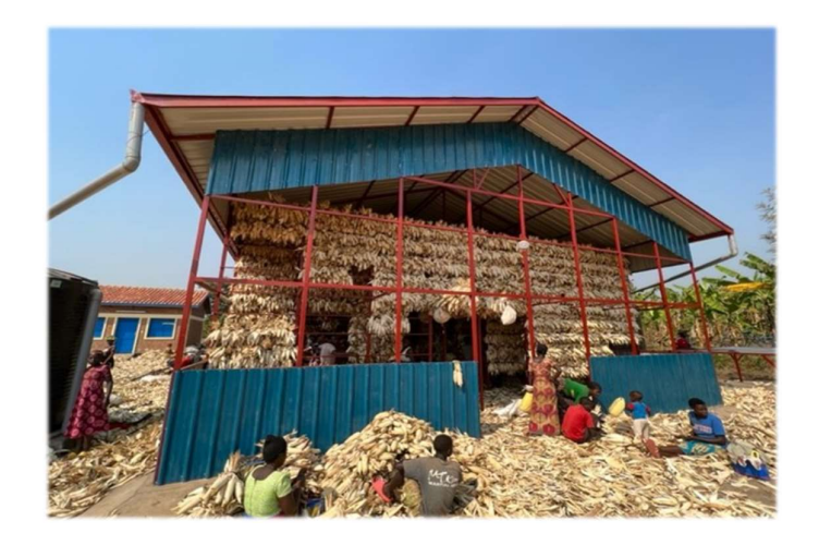
Drying shed built by UNHCR to support refugee and Rwandan farmers working in the Nyabicwamba marshland project