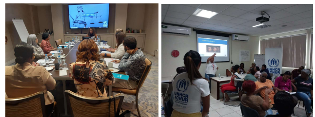
Round table for legal professionals in Aruba