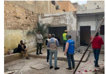
Repair work at the sewage lifting station in north Benghazi.

UNHCR partner, Norwegian Refugee Council (NRC), started the repair work to a sewage lifting station in north Benghazi. The lifting station, which distributes sewage, will service the Sidi Houssein neighbourhood, which is home to around 14,000 people including refugees and many who returned after fighting in Benghazi in 2017. The project is part of efforts to rehabilitate basic infrastructure in areas previously affected by conflict. It will include structural, plumbing, tiling and electrical work.