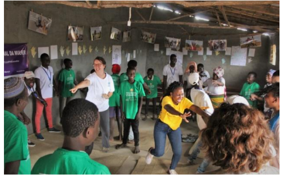
UNHCR and partner conducting mental health and psycho-social support activities with displaced communities in Metuge, Cabo Delgado.