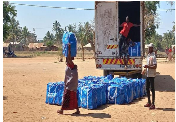
Distribution of core relief items (CRIs) in Erati district, Nampula province.