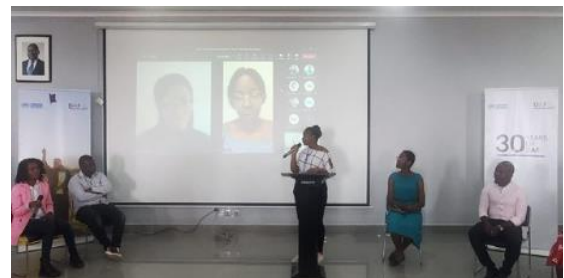
30 th anniversary of the DAFI programme, Nampula.