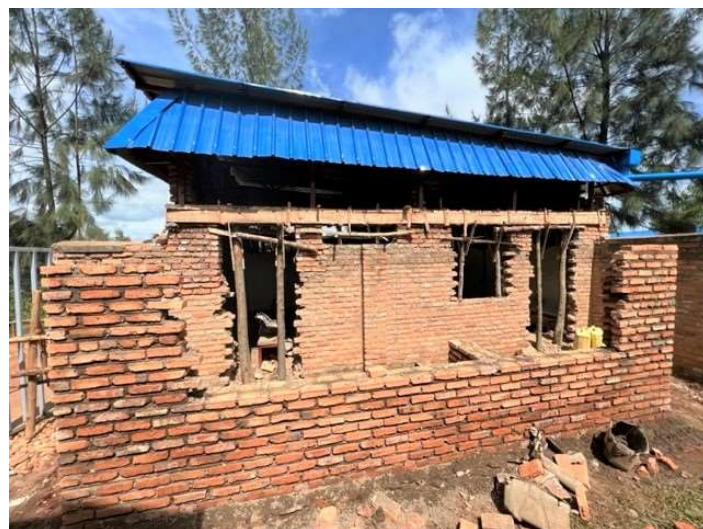
Transformation of the waiting area outside the MINEMA office into a Police outpost in Nyabiheke camp.